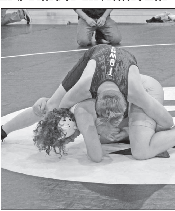
Towns County wrestling in action during a recent match.

Next up, the Indians will see more mat action starting at 5 p.m. on Friday, Dec. 16, away against Murphy, North Carolina, and again the following day Saturday, Dec. 17, in another away match at Stephens County High School for the Arrowhead Classic starting at 8 a.m. Go Indians!